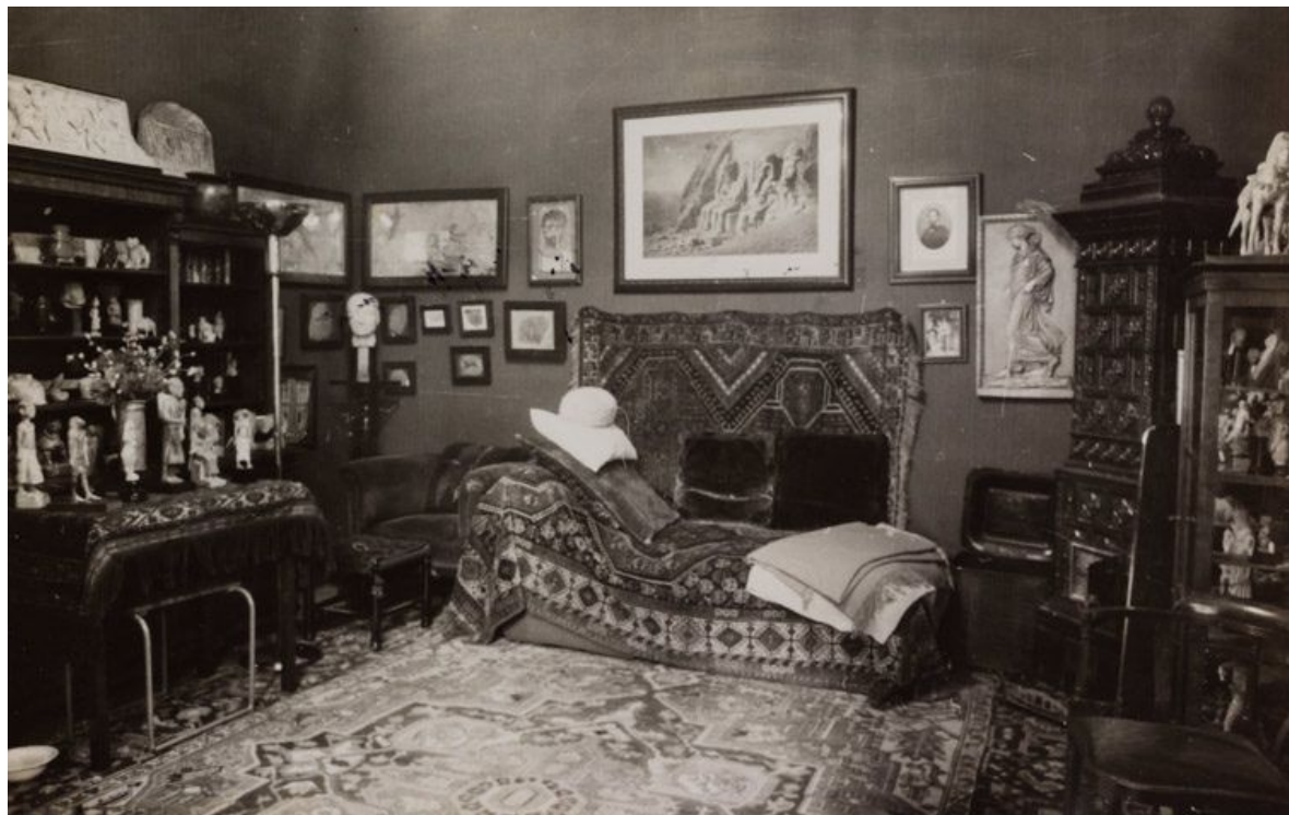
Freud's office at Berggasse 19, Vienna, Austria.