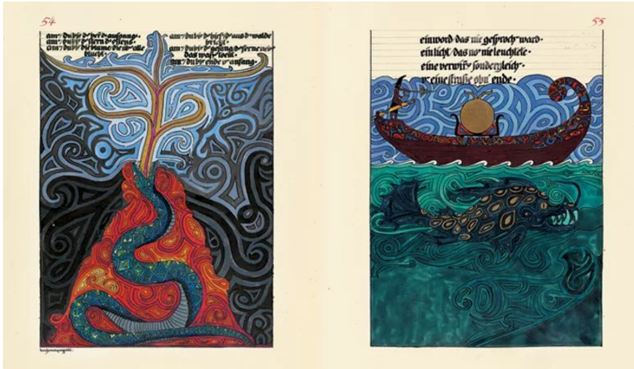
Pages from Jung's Red Book , a compilation of his fantasies originally recorded by Jung in a series of notebooks and then published in 2009.