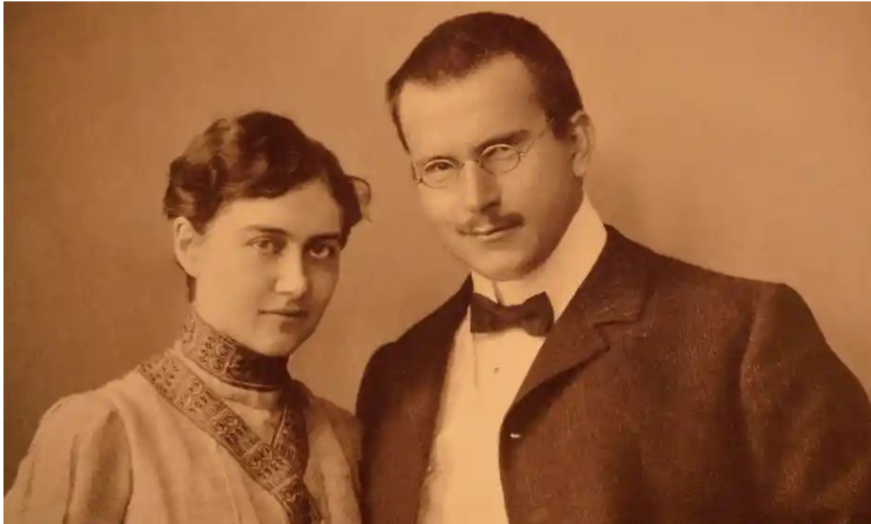
Emma and Carl Jung, 1903.