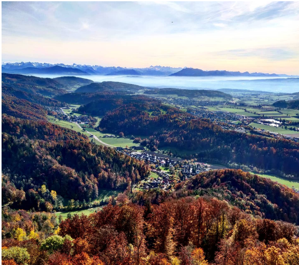
View over Zürich from the Uetliberg Mountain.